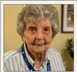
Oldest Mother 96 years old