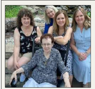
Mother of Multiples Twin Girls & 2 other girls