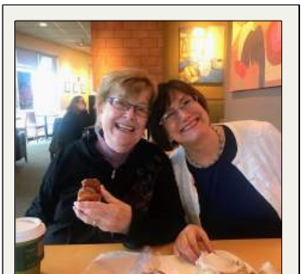
Mother of Multiples Twins & 4 other children