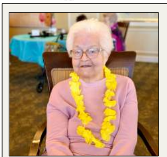
Mother with Most Children Seven children