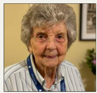
Mother with oldest child 71 years old