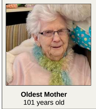
Oldest Mother 101 years old