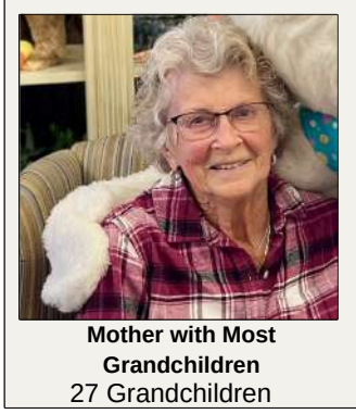
Mother with Most Grandchildren 27 Grandchildren