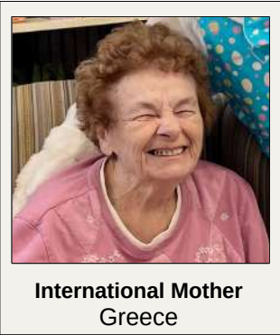
International Mother Greece