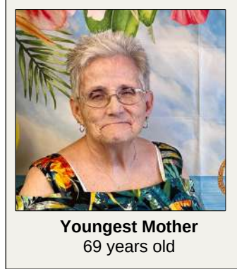
Youngest Mother 69 years old