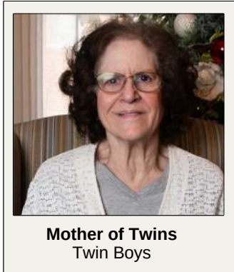
Mother of Twins Twin Boys