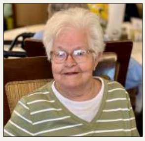
Mother with Most Children Seven children