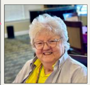
Mother with youngest child 42 years old